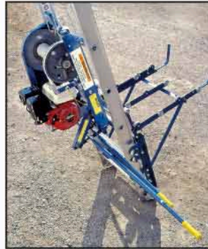
400 lb. Platform Hoist w/ Classic Power Drive

Platform Hoists are easy to transport and assemble and require minimum maintenance. A variety of available accessories makes RGC Platform Hoists the most versatile on the market.